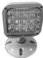
Single Lamp with Weatherproof (WP) Option