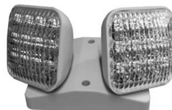
Double Lamp with No Options